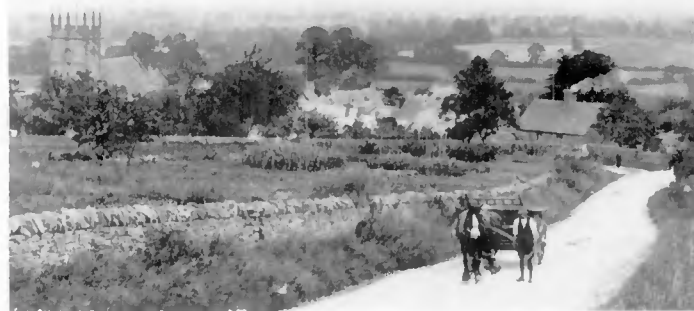
An early 20th century view over Longborough