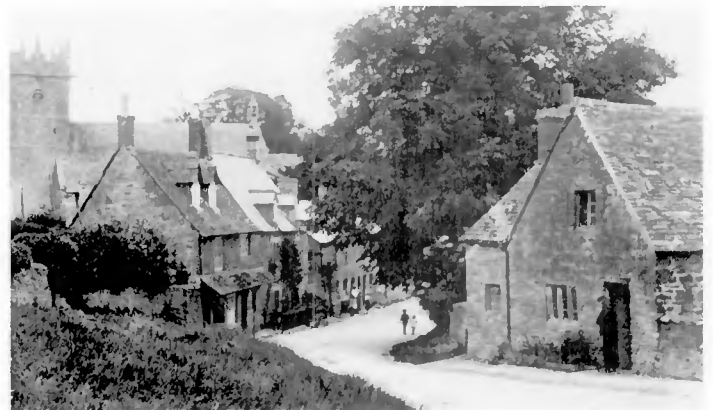
Church Street, Longborough