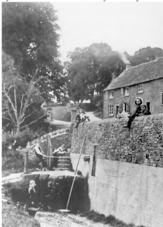
Site of Longborough village's water supply until recent times

grant of Edmund Earl of Cornwall, but the Abbey did not hold jurisdiction in the vill of Longborough. Although the abbot claimed to have a charter from Henry III, this was disputed by the King's agent, who said the manor had been granted to Richard and Sanchia as a free dowry, and that it had been alienated contrary to the wording of the said grants. The Abbot offered to pay one mark (66.6p) so that he could continue to hold the manor until the next Hearing, but unfortunately died before the money was handed over! The new Abbot was summoned to answer by what right he held the manor of Longborough etc., which is from ancient times the demesne land of the crown of the Lord