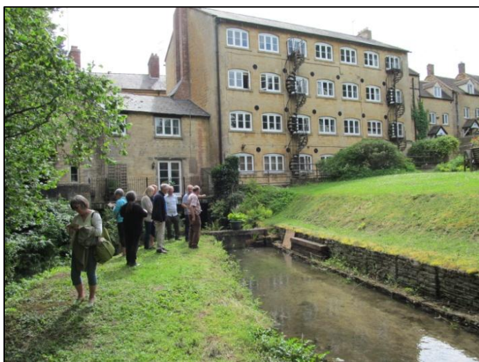
The mid-19 th -century Westmacott's Mill (now converted into flats, as Blockley Court) seen from the grounds of Snugborough Mill.