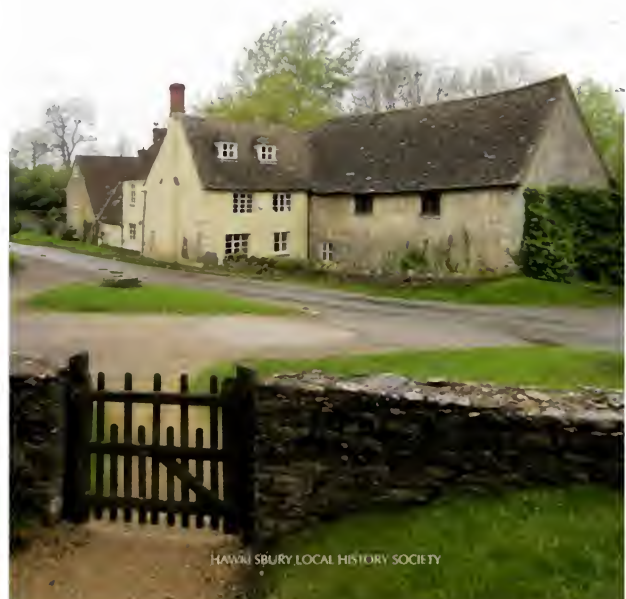
The Church Houses of Old Gloucestershire. £6.50, including postage and packing