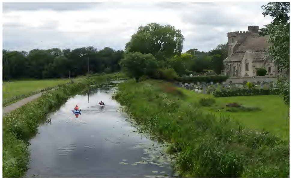
One of the views featured on the walk to the Stroudwater Canal and St Cyr's Church.

We will be presenting an exhibition featuring some of our recent research projects, including the memories of local people. We are offering a choice of walks around the town and surrounding countryside