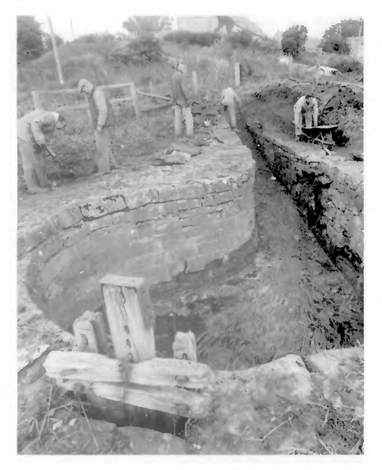
Fig 5. Cutsdean sheepwash being repaired

probably a mild caustic solution to break down the oils in the fleeces. This solution would have been allowed to dissipate into the soil after release through the side sluice into the meadow, rather than into the river.