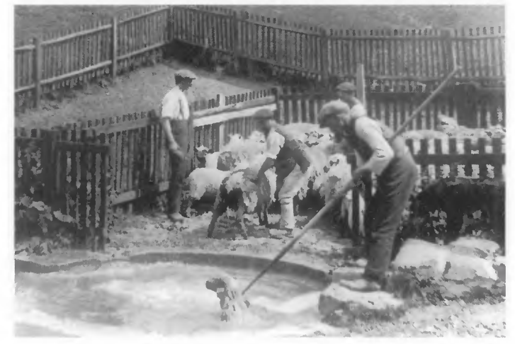
Fig 3. Cleeve Common sheepwash in use before 1919

The drawings show that a dam was made across the head waters of the Isbourne in Watery Bottom, Cleeve Common, to create a small pond of water. The washpool, below the pond, (Fig. 2), is 10 feet in diameter and is made of ashlar limestone blocks with a sloping ramp. The stones were set in cement with a clay puddle backing to keep the pool water tight. Water was admitted from the pond by an iron pipe controlled by a valve and allowed to flow out freely by overflow. The pool could be drained by another pipe and valve. Mr. Witts, civil engineer of Cheltenham, advised on its construction. It must have been one of the last, perhaps the last, sheepwash to be built, and was in use until at least the mid 1930s. A description of the wash in use is to be found in a 1919 book by J. H. Garrett From a Cotswold Height . (3). Figure 3 shows sheep being washed there before 1919. The wash has recently been repaired and fenced by the Cotswold Warden Service.