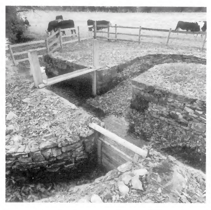
Fig 6. Baunton sheepwash reinstated 1994

Two wooden sluices control the level of the water in the wash and a sloping escape ramp leads into the west meadow. Further upstream another sluice directs water into the leet leading to Trinity Mill, enabling the sheepwash to be isolated during use. During 1994 the whole structure was renovated by the Cotswold Voluntary Warden Service after removal of several trees which were growing in the walls. (Fig. 6)