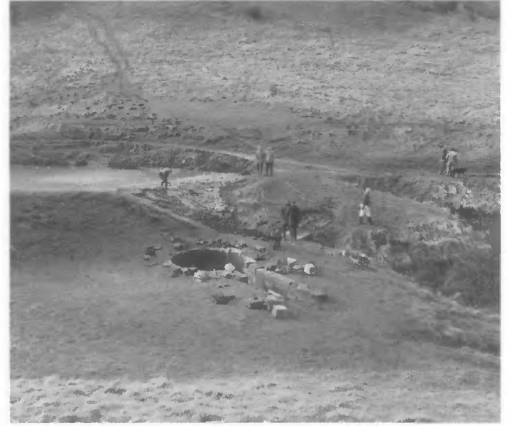
Fig 2. General view of Cleeve Common sheepwash undergoing repair 1994

SHEEPWASH ON CLEEVE COMMON IN SOUTHAM PARISH MAP REFERENCE SO 996264