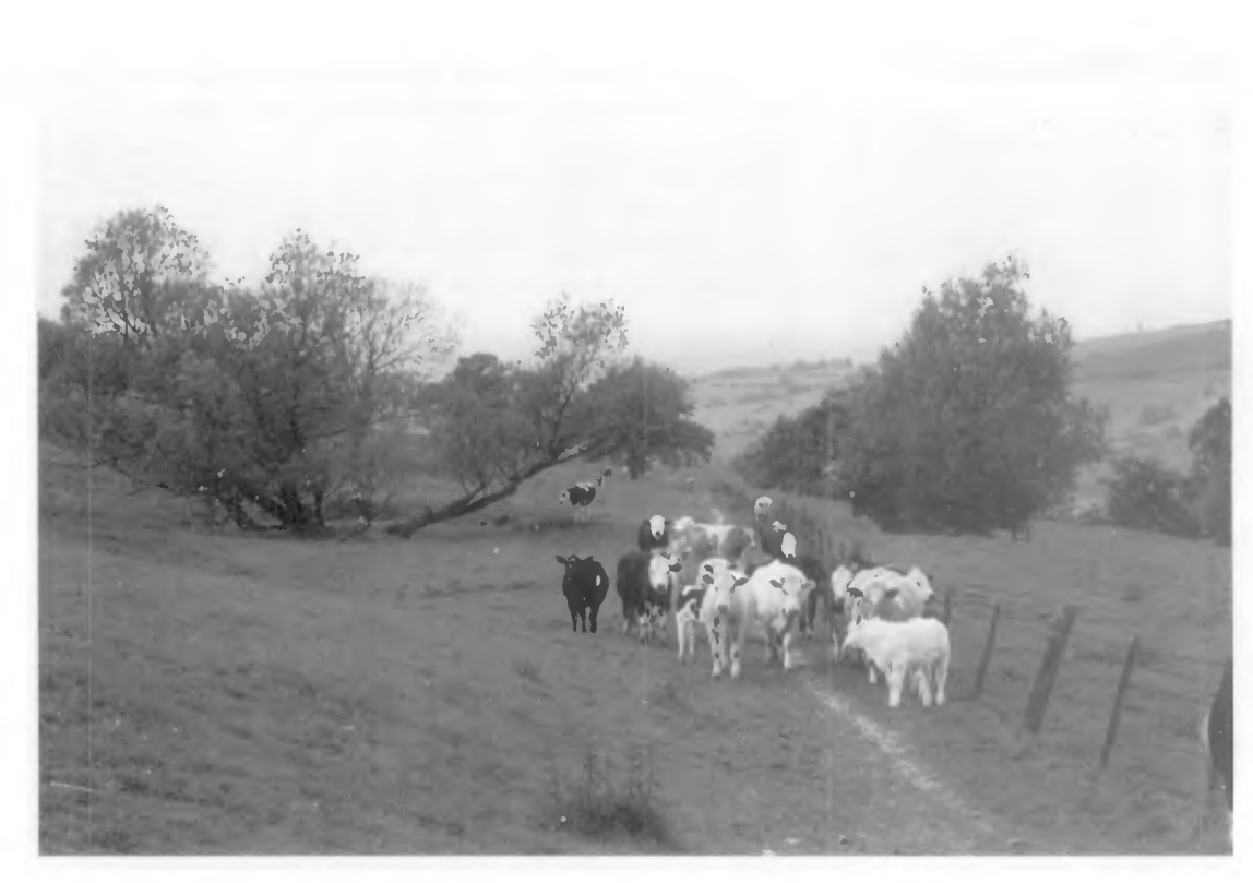
Fig 4. General view of sheepwash complex in Prescott Park. Trees on left of the track are in silted up pool. Those on the right are in the sheepwash