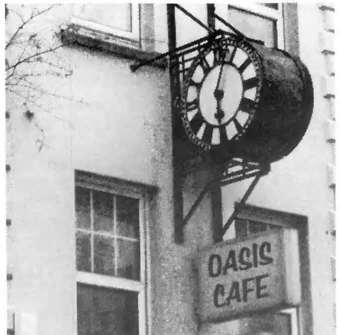
The clock over Oasis Café at No. 59 Southgate Street

located. According to Dowler, one Edmund Simpson occupied No.122 Southgate Street from 1867 until 1885. 54 Using Done's plan, it was quickly established that this site is now No.59, occupied by the Oasis Café. It was noted with interest that on the front face of the building at first floor height, a somewhat dilapidated double