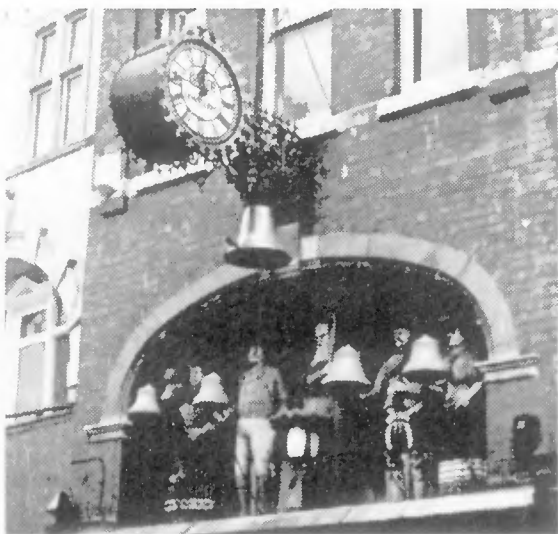
Niehus Brothers clock