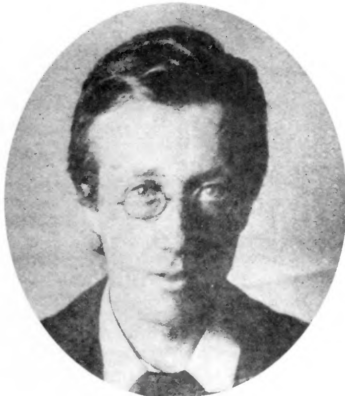
Gustav Holst as a student