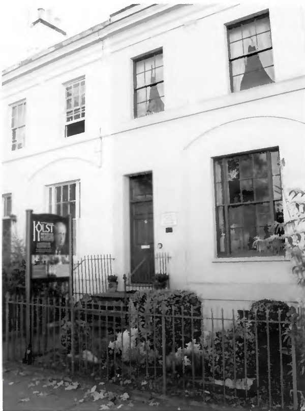
4 Clarence Road today: Holst Birthplace Museum