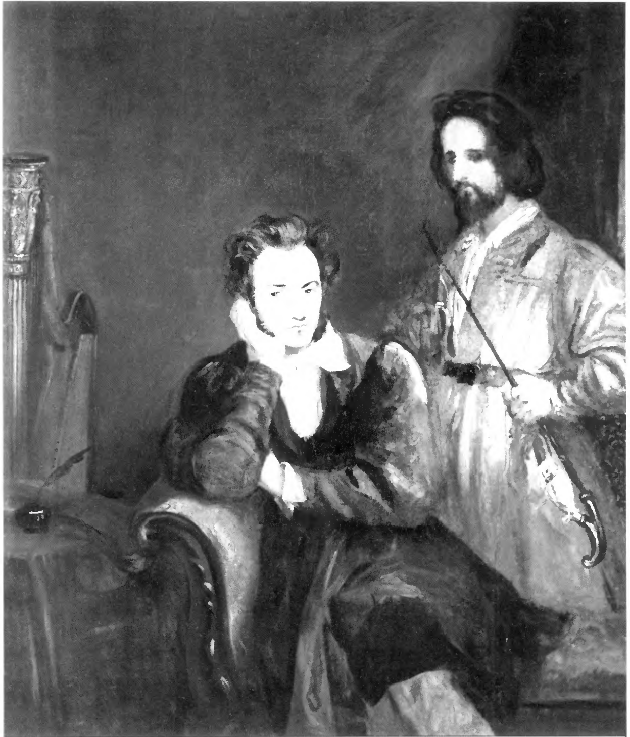
Portrait of Gustavus (foreground) painted by his brother Theodor (background) c 1832—37 Cheltenham Art Gallery & Museum, on display at Holst Birthplace Museum.

ladies could enjoy a very active social life that would be enhanced by acquiring such desirable skills as singing and playing musical instruments. In this they were encouraged by performances in the town by the stars of the London opera stage and instrumental virtuosi such as Paganini and Olé Bull each of whom came to play twice in the 1830s.