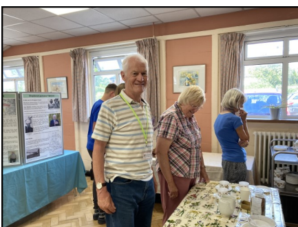
Stonehouse History Group's committee and volunteers organised the day's activities. The buffet was sourced from local catering firm Le Tartistry.